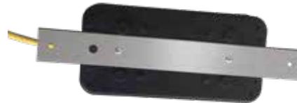
Quick Fix Plate